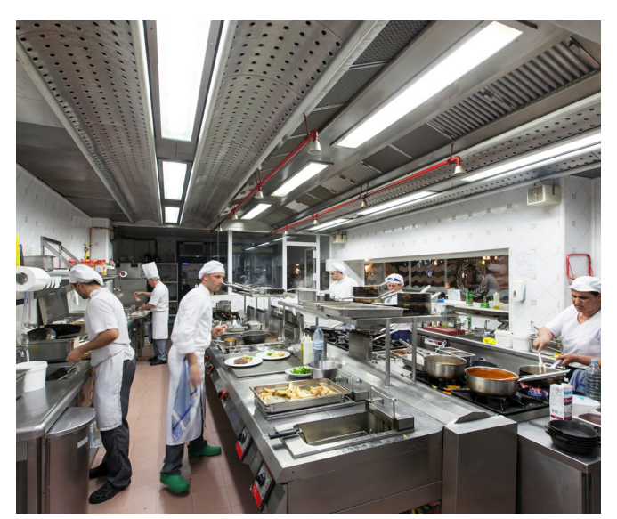
Kitchen, storage rooms, offices

Comply with regulations and support the needs of staff to perform at their best.