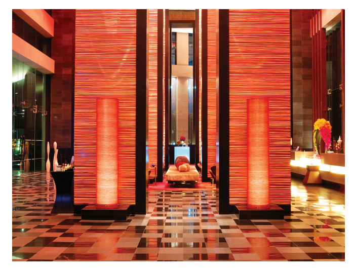
Lobby / foyer

First impressions matter, greet your guests in the best light.